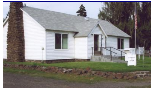
Bonanza Community Center & Branch Library

Our Library Foundation is a diverse group of individuals united by their love of reading, life-long learning, and their sense of community service. Immediately after our foundation received its non-profit status in 2004 we began a capital campaign to expand the children’s area at the main Klamath County library. Now that we have successfully completed this project, we are beginning a new capital campaign. Our efforts are now focused on improving the reading and learning experience of the residents served by the Bonanza branch library. Our plan is build a 1,900 square foot addition to the existing 900 square foot community center. The community center and the branch library now share the same space.